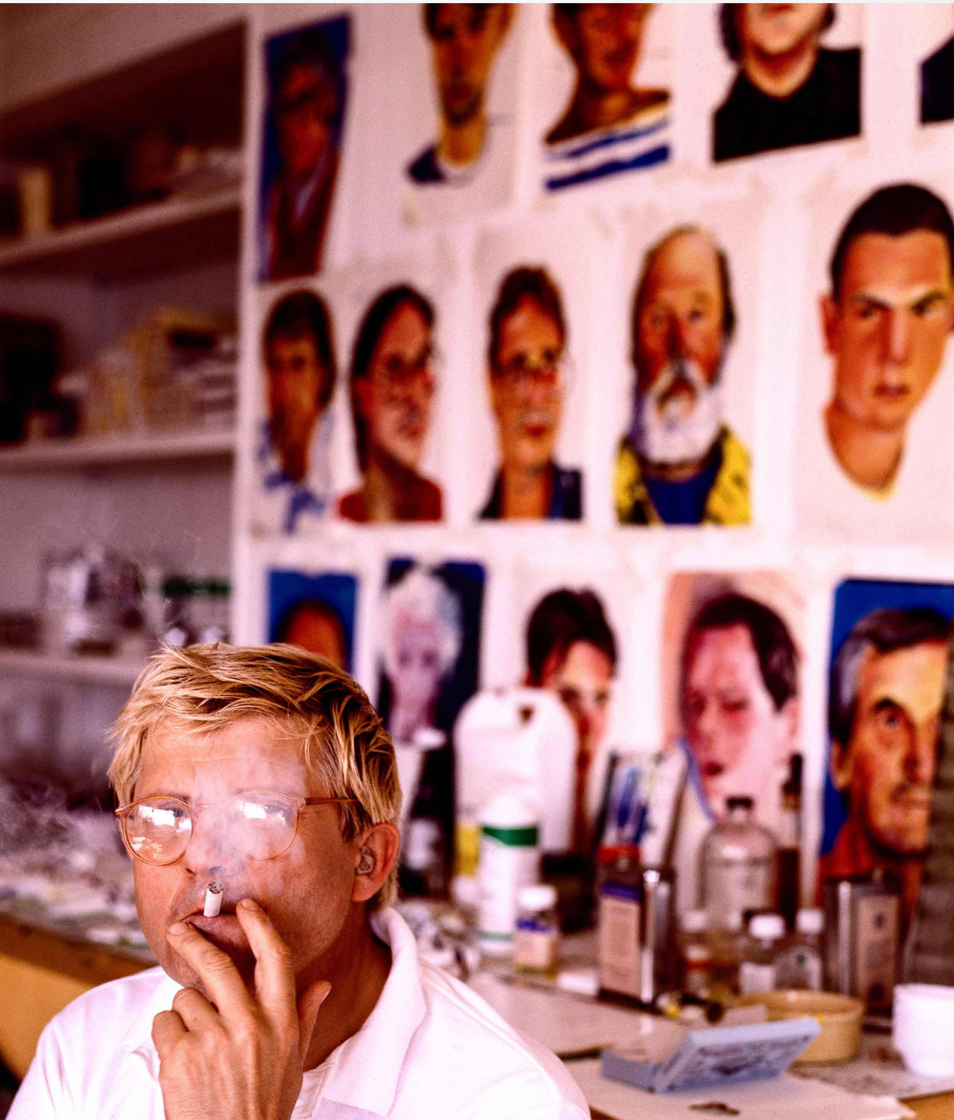
Greg Gorman David Hockney Malibu, California, 1989