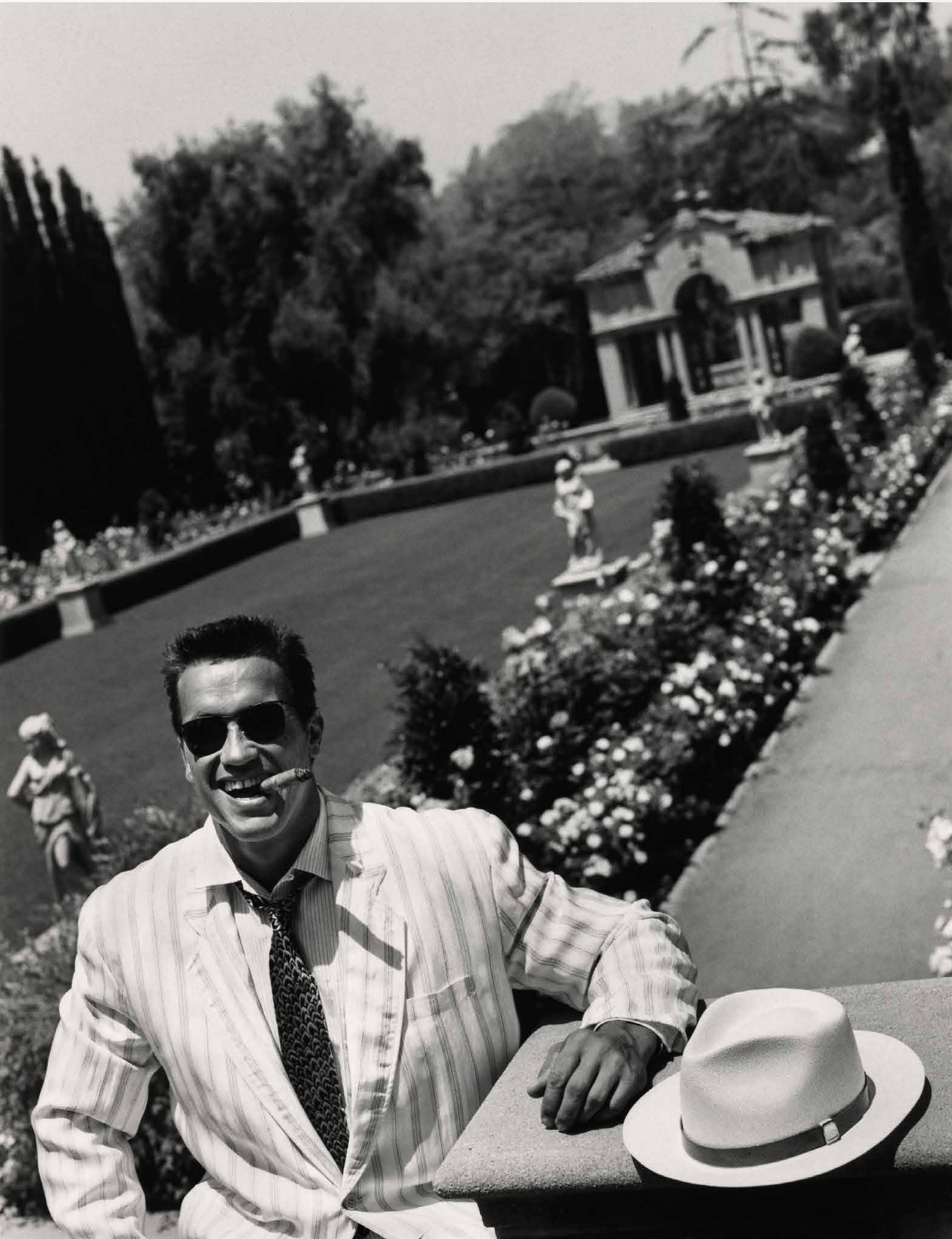
Arnold Schwarzenegger Los Angeles, 1986