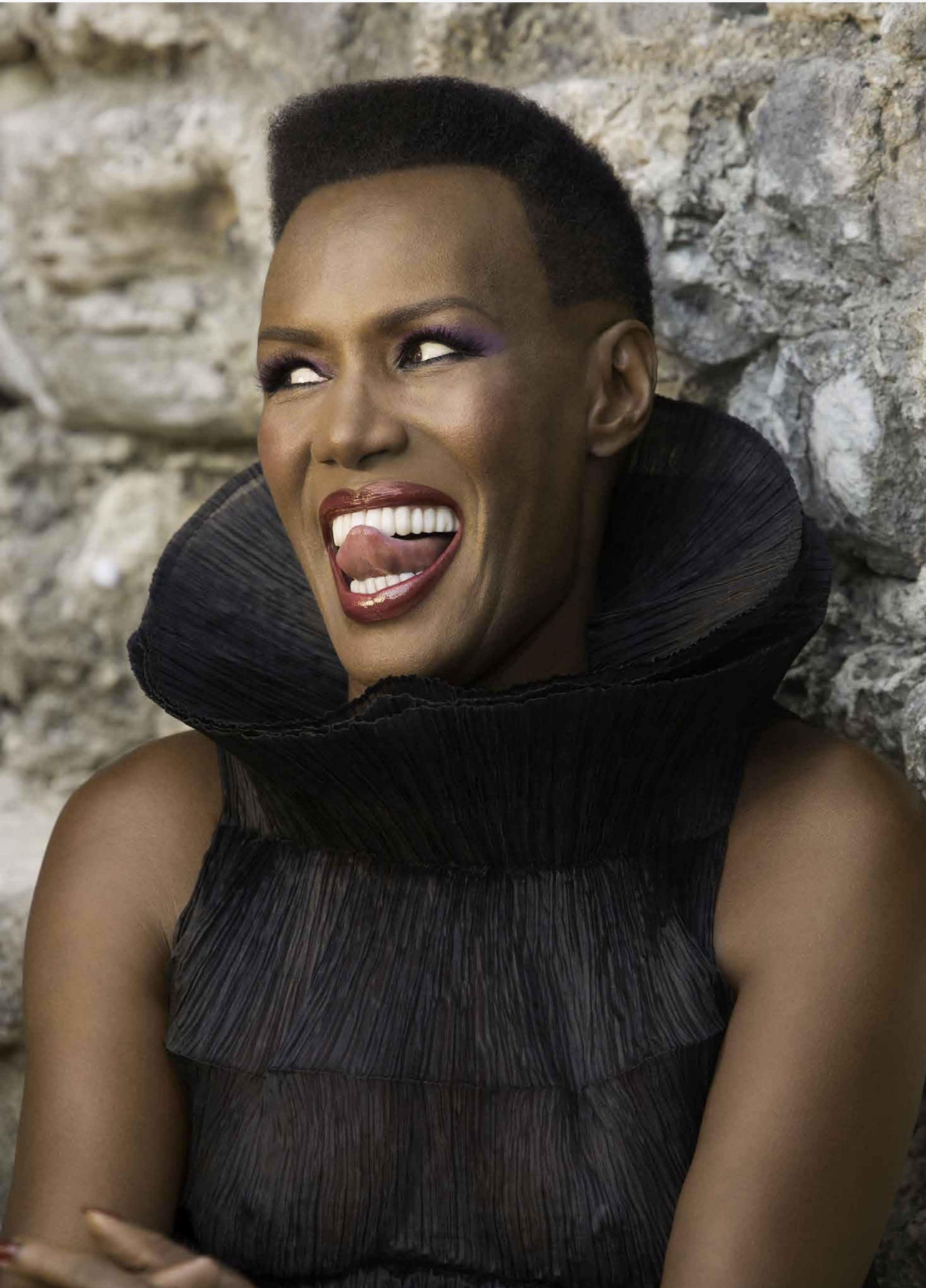
Greg Gorman Grace Jones Jamaica, 2015