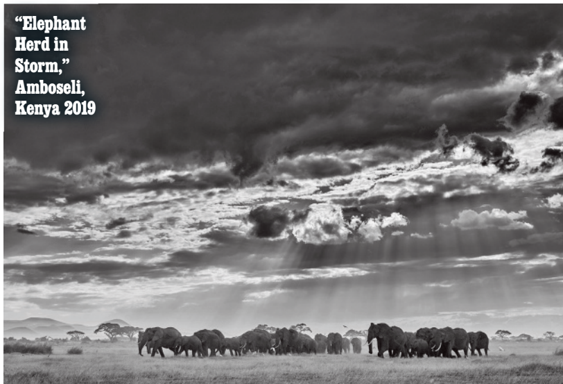
"Elephant Herd in Storm," Amboseli, Kenya 2019