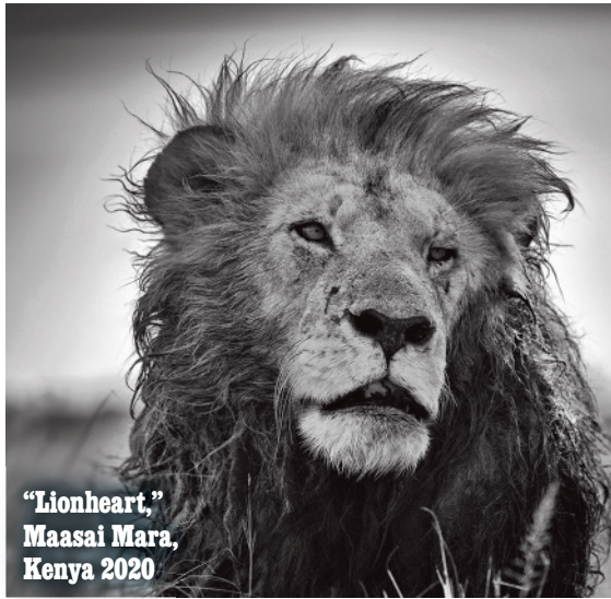
"Lionheart," Maasai Mara, Kenya 2020