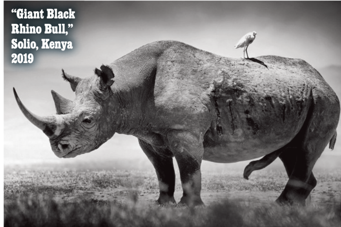
"Giant Black Rhino Bull," Solio, Kenya 2019