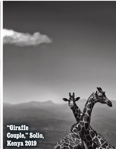
"Giraffe Couple," Solio, Kenya 2019