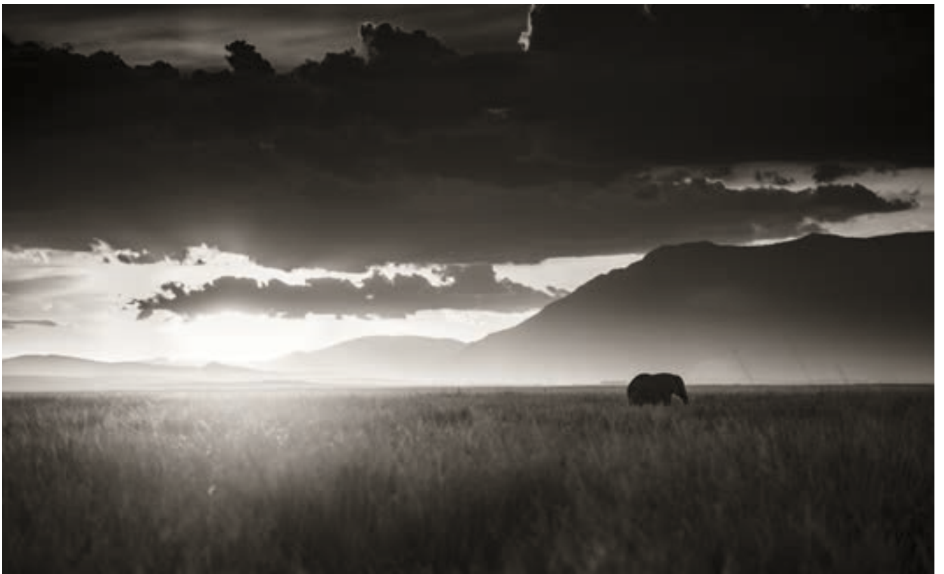
T: Just like humans, elephants comfort each other in stressful situations. This is one of the many functions of the trunk. Here, the hand of the caretaker assumes this role until the elephant is two years old. B: Elephant walking through tall grass in sunset, Amboseli National Park, Kenya 2017.